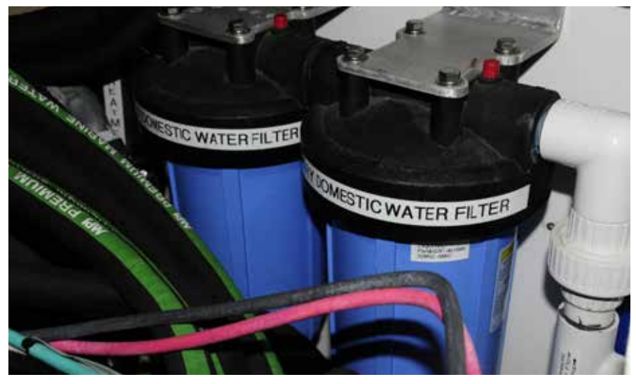
Whole-vessel filtration is gaining popularity as filters that can remove particulates as well as chlorine and heavy metals become readily available, inexpensive, and easy to replace.

Potable-water filters are either whole-vessel or point-of-use. Wholevessel filters are essentially the same as whole-house filters, many of which are available from marine and home improvement retailers. They filter all the water as it's supplied aboard the vessel. This all-encompassing approach improves overall water quality, and there's no concern about