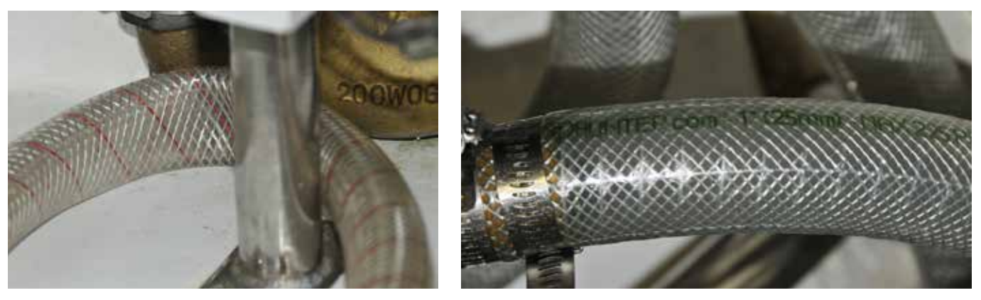
Left —While it's commonly installed in onboard water systems, especially by do-it-yourselfers, clear PVC hose is prone to kinking and crushing and should be avoided. Right —The exception is kink- and crush-resistant wire-reinforced PVC hose, which is appropriate for pressure and suction applications.

More rigid PVC and chlorinated polyvinyl chloride (CPVC) pipe popular in residential and commercial buildings is also viable for marine applications (because it's impermeable