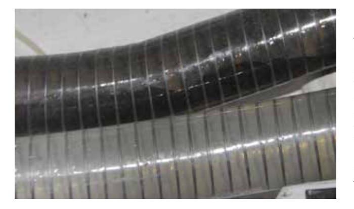
Potable-water systems, especially those with clear hose, are prone to contamination. The black accumulation inside the top hose doesn't bode well for the quality of the water that passes through it.

On the positive side, copper is extremely durable and, with just a few exceptions, probably the last plumbing system ever needing to be installed aboard any boat. It simply