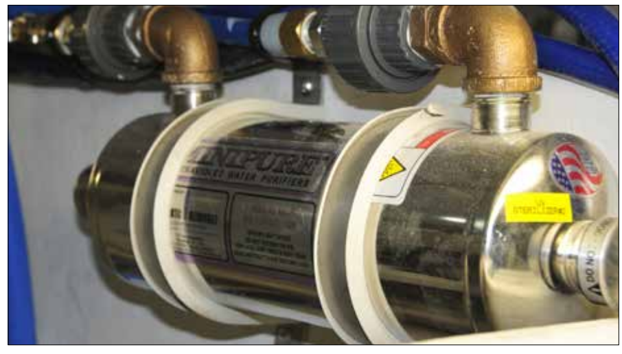
Water-treatment systems that rely on ultraviolet light are effective at eradicating biological contamination. Most include a sight glass to confirm operation of the bulb. When installing these filters, ensure access for bulb replacement.

chamber illuminated with a UV light, which kills most biological life-forms. Provided it's sized properly and maintained (the bulbs require periodic replacement, often annually), this is yet another effective step to ensure that water is clean and contaminant-